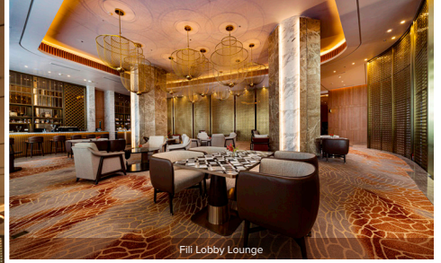
Fili Lobby Lounge