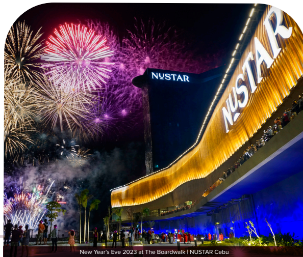
New Year's Eve 2023 at The Boardwalk | NUSTAR Cebu

The sprawling resort complex, which has a gross floor area of 300,000 square metres, is about 30 minutes from the Mactan-Cebu International Airport via the Cebu-Cordova Link Expressway (CCLEX),