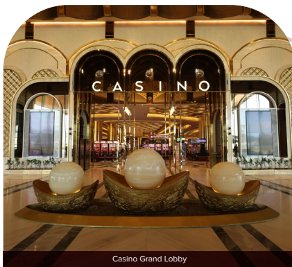
Casino Grand Lobby

NUSTAR is home to a two-level casino with a mix of gaming tables and machines peppered across a 21,000 square metre floor area, making it the largest and most varied gaming floor in the region. With a wide array of table games, slot machines, plus a gaming stadium and exclusive VIP rooms, guests can discover an exhilarating gaming experience and the thrill of winning.