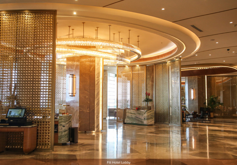
Fili Hotel Lobby