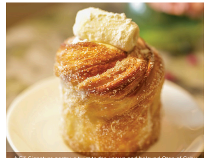
A Fili Signature pastry, a twist to the known and beloved Otap of Cebu

Fili Hotel promises a luxurious 5-star experience that is distinctly Filipino and uniquely Fili.