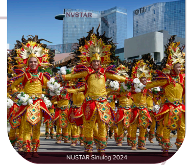
NUSTAR Sinulog 2024