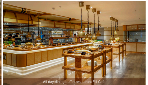
All-day dining buffet restaurant Fili Cafe