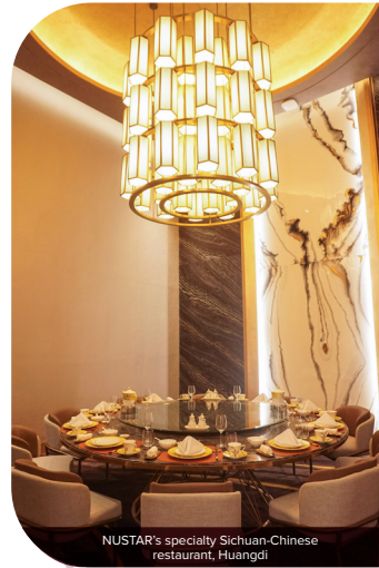
NUSTAR's specialty Sichuan-Chinese restaurant, Huangdi

It is composed of three banquet halls, a lobby, a pre-function foyer and hallway, an open area lounge, and a bridal lounge. It also offers a range of dedicated spaces for different needs, and an open area lounge that is perfect for casual gatherings, networking sessions, and after-parties for guests. Furthermore, the spacious lobby, measuring 179 square metres, enhances the overall experience for guests as they arrive at the venue, with its sweeping view of Cebu's clear blue waters.