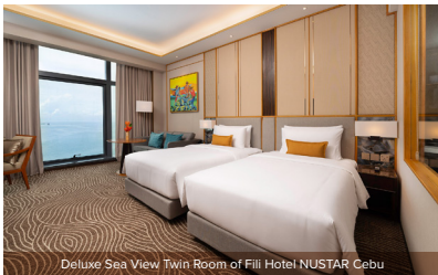
Deluxe Sea View Twin Room of Fili Hotel NUSTAR Cebu

Guests staying in suites also get access to The Executive Club, which offers exclusivity, comfort, and fantastic views.