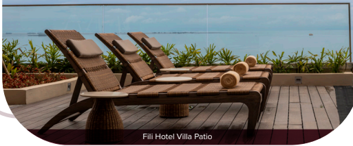
Fili Hotel Villa Patio

making it a short and scenic ride to the resort for guests. Alternatively, water transfers will be available through the Wharf, the integrated resort's 35-metre-long private dock.