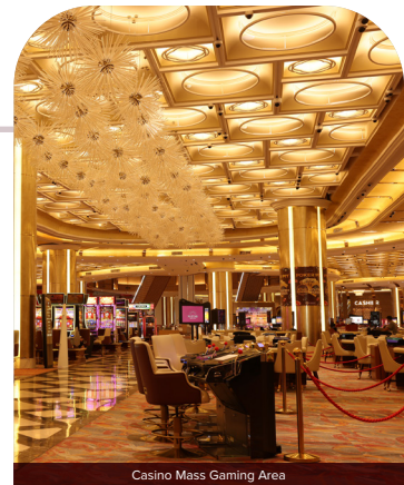
Casino Mass Gaming Area